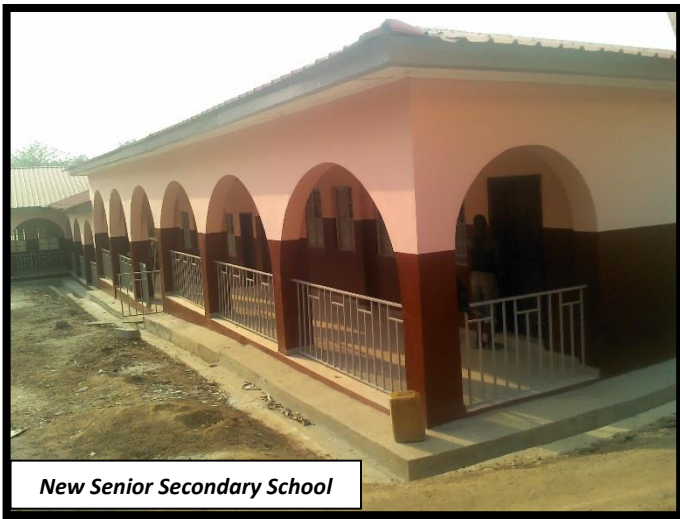
New Senior Secondary School