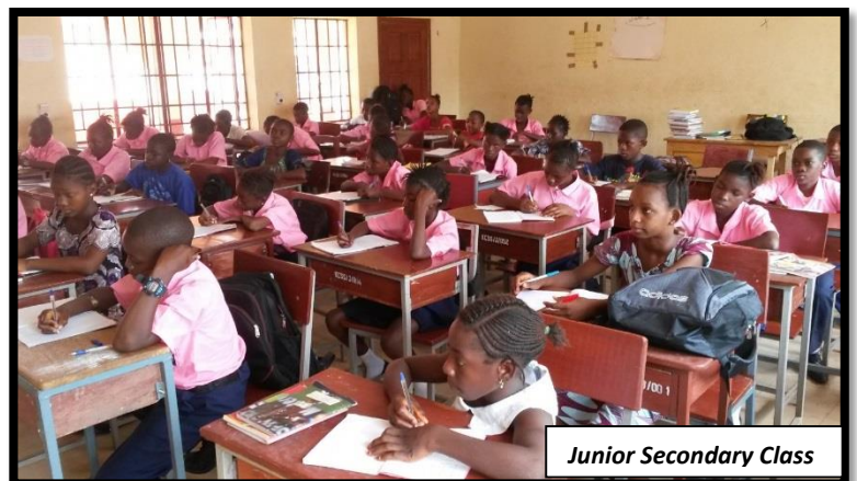
Junior Secondary Class

The Kabala Christian School Board has been meeting regularly to address all the policy challenges of a very popular growing school. Please remember them in your prayers.