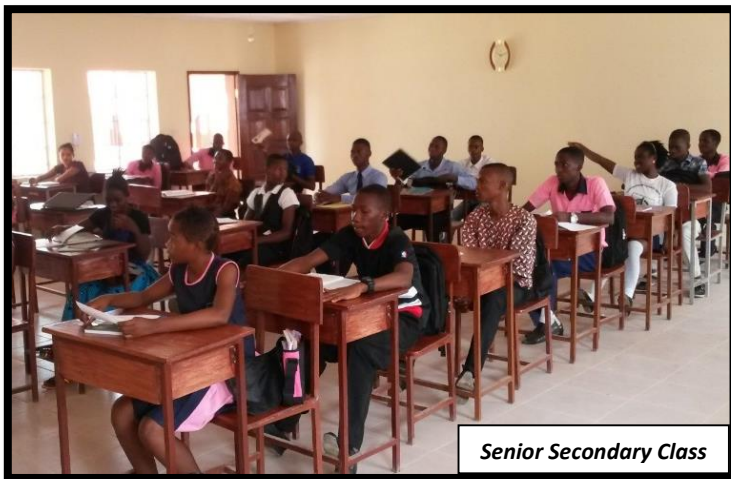
Senior Secondary Class