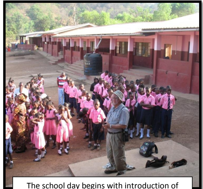
The school day begins with introduction of guests, songs and a flag raising ceremony.

The main purpose of my visit was to assist the school in the negotiation of a construction contract with the NIMO Construction Company. The price of the basic structure (not including equipment) is $410,000.